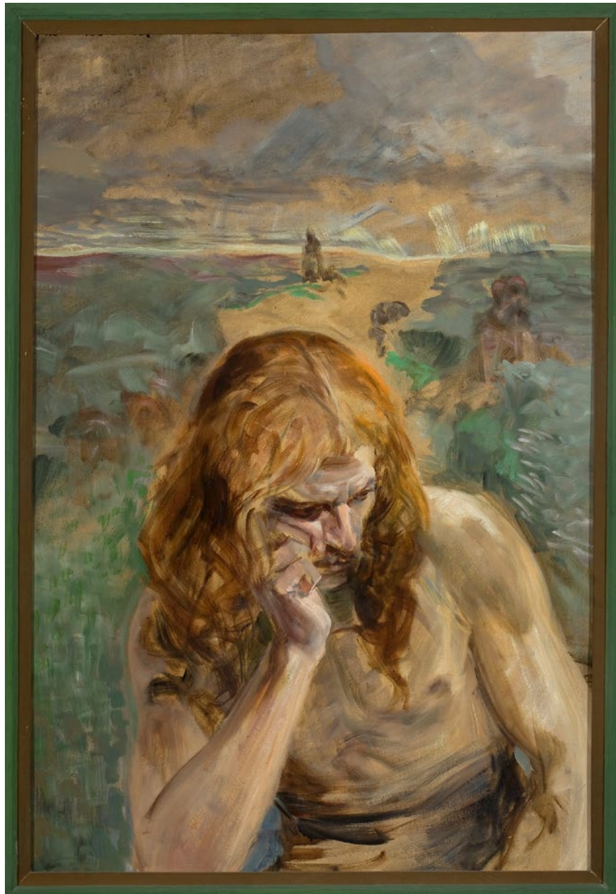
St. John the Baptist, 1911