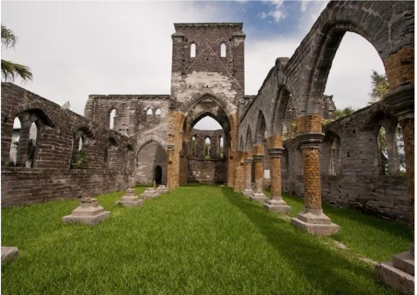
The Unfinished Church in St. George's, Bermuda

“Cheap grace is grace without discipleship, grace without the cross, grace without Jesus Christ, living and incarnate.”