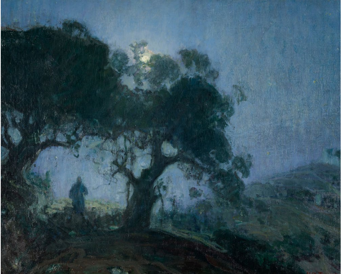
Good Shepherd, 1902-1903