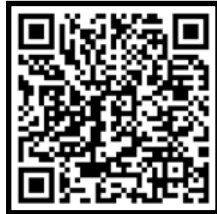
SIGN-UP TO DONATE FOOD